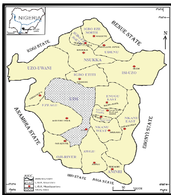
Figure 1: Enugu State Showing the Study Area