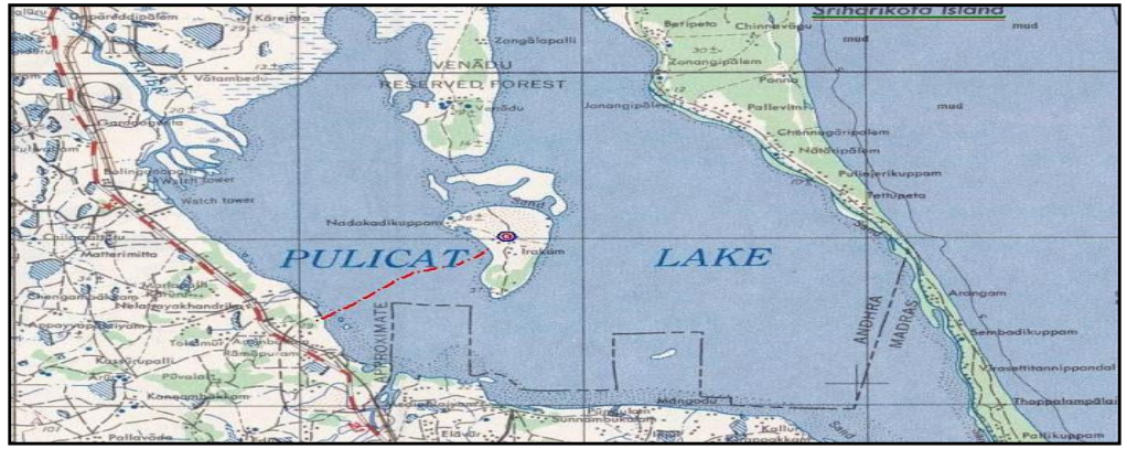
Figure 1: Location map of the Pulicat Lake

In natural systems, potentially toxic heavy metals can originate from rocks, ore minerals, and volcanoes. Weathering releases metals during soil formation and transports them to surface and or aquifer waters.