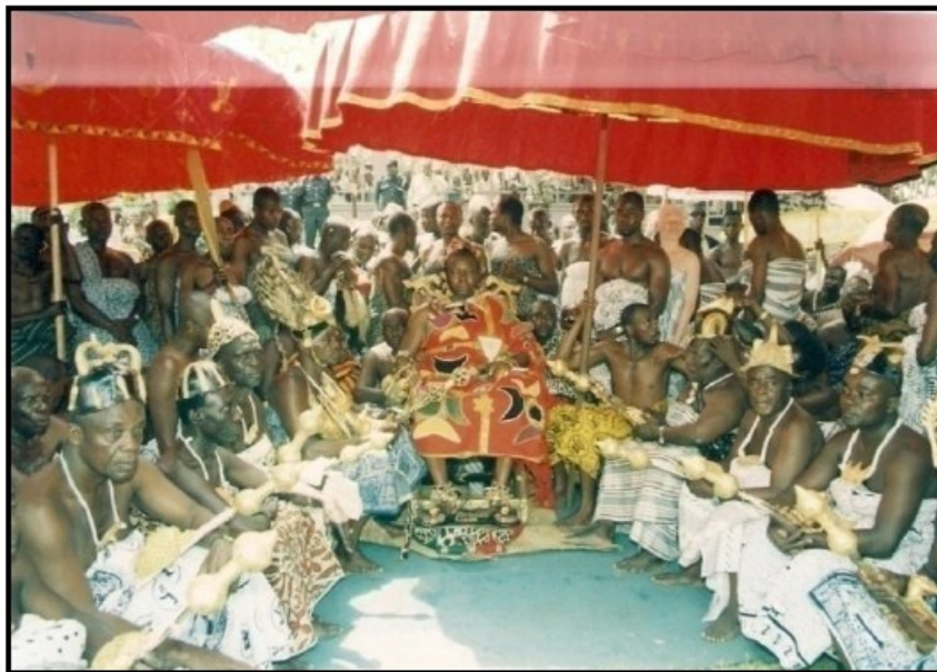
Figure 9: the Asantehene Osei Tutu II during an Akwasidae

Three major festivals of the Asante ethnic group are the Akwasidae, Awukudae and Adaekesee. The Akwasidae is celebrated on Sundays only, every forty days throughout the year. In the Ashanti calendar with nine months making a year, the Akwasidae festival marks the beginning of a new month. Every month has forty days. It is a day for remembrance of the ancestors. In the morning of an Akwasidae, the Asantehene goes to the mausoleums to pour libation and offer prayers to the ancestors. Requests and the needs of the people would be asked of the ancestors and the stool houses of various families may be opened to the family members. They pour libation, offer sacrifices and ask for the help of their ancestors as a family, which crowned by a grand durbar where the Asantehene sits in state surrounded by his retinue of elders (Figure 9).