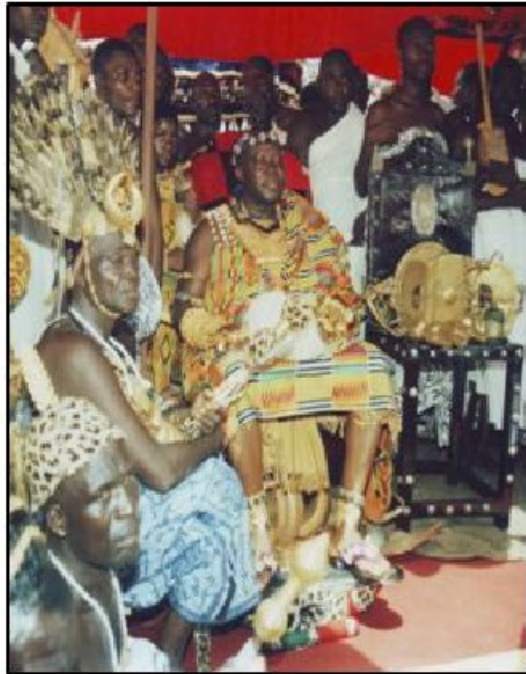
Figure 1: The current Asantehene (Osei Tutu II)

stewards at their service. In both cultures, the two kings sit on state stools with their sub-chiefs and subjects sitting around them to showcase their grandiose (Figures 1 & 2).