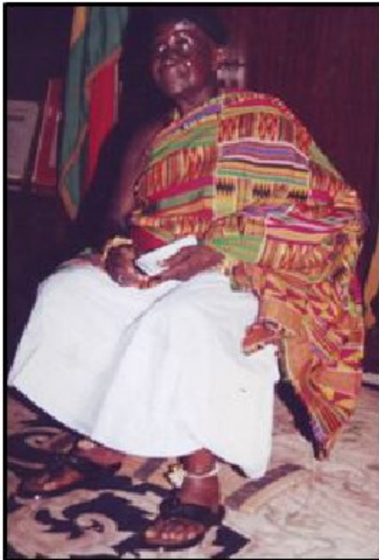
Figure 3: The current Asante Queenmother