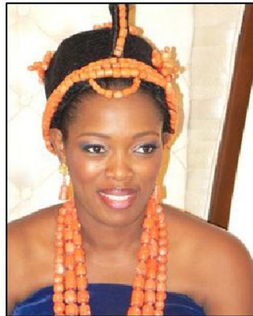
Figure 4: The Erenanowei oOporoma