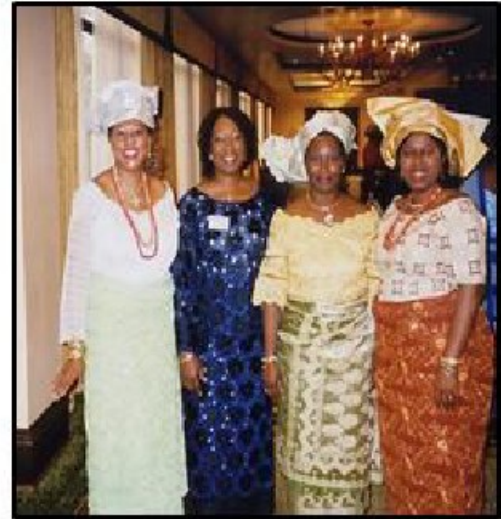
Figure 6b: Traditionally dressed Ijaw Women