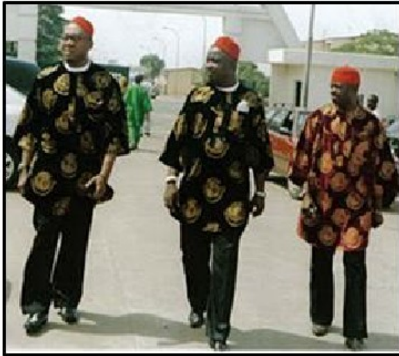
Figure 6a : Traditionally dressed Ijaw Men

(Figure 8). The Ijaw woman wears a blouse with two wrappers on her waist and a headgear (Figure 6b).