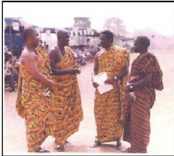
Figure 7: Traditionally dressed Asante men