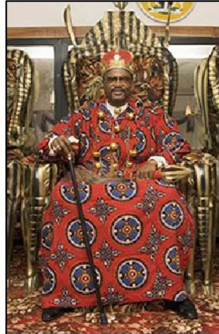
Figure 2: The Amanyanabo of Bomo clan

Responses from the field indicate that both the Asante and Ijaw practice matrilineal and patrilineal inheritance respectively. Kings are not made outside the royal family and even though there are differences in their practice of inheritance, either through maternal or paternal links, kingship remains in the royal family.