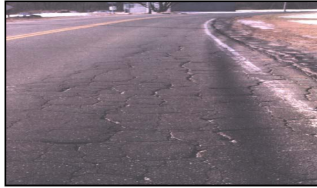
Figure 3: High severity alligator cracking