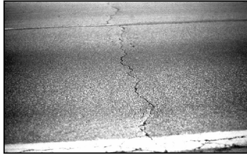
Figure 5: Low severity transverse crack