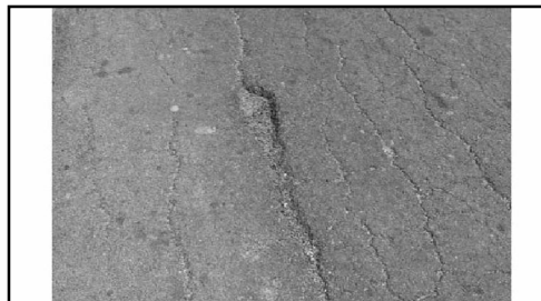
Figure 4: Longitudinal Cracking

Longitudinal cracks are long cracks that run parallel to the center line of the roadway. These may be caused by frost heaving or joint failures, or they may be load induced. Understanding the cause is critical to selecting the proper repair. Multiple parallel cracks may eventually form from the initial crack. This phenomenon, known as deterioration, is usually a sign that crack repairs are not the proper solution.