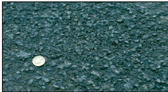
Figure 12: High severity ravelling of asphalt surface

Ravelling is the loss of material from the pavement surface. It is a result of insufficient adhesion between the asphalt cement and the aggregate. Initially, fine aggregate breaks loose and leaves small, rough patches in the surface of the pavement. As the disintegration continues, larger aggregate breaks loose, leaving rougher surfaces. Ravelling can be accelerated by traffic and freezing weather. Some ravelling in chip seals is due to improper construction technique. This can also lead to bleeding. Repair the problem with a wearing course or an overlay.