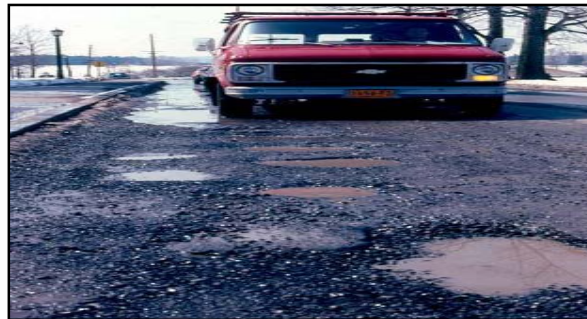
Figure 10: Potholes caused by poor drainage

Potholes are bowl-shaped holes similar to depressions. They are a progressive failure. First, small fragments of the top layer are dislodged. Over time, the distress will progress downward into the lower layers of the pavement. Potholes are often located in areas of poor drainage, as seen in Figure. Potholes are formed when the pavement disintegrates under traffic loading, due to inadequate strength in one or more layers of the pavement, usually accompanied by the presence of water. Most potholes would not occur if the root cause was repaired before development of the pothole. Repair by excavating and rebuilding. Area repairs or reconstruction may be required for extensive potholes.