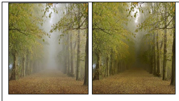
Figure 1: An Example Of Haze Removal By The Proposed Method Left: Original Image. Right: Dehazing Result

Often the images of outdoor scenes are basically degraded by the improper weather conditions and by the presence of different particles such as fog, haze and the water droplets in the atmosphere that significantly degrade the visibility of the scene. Since the aerosol is misted by additional particles, the reflected light is scattered and as a result, distant objects and part of the scene are less visible being identified by reducing contrast and dim colours. Since restoring images degraded by haze is essential in several Outdoor applications such as remote sensing, intelligent vehicles, object recognition, surveillance. In this paper we present a novel dehazing method, built on the principle of image fusion. The main idea is to combine several images into a one, keeping only the most significant features. Then the inputs are weighted by normalized weight maps (luminance, chromatic and saliency) and finally combined in a multi-scale fashion, by using a laplacian pyramid representation of the original input that are combined with Gaussian pyramids of normalized weights that avoids introducing artifacts. The method is fast and being straightforward to implement Similarly, Several advantages of our technique against the previous one. First, our approach performs an effective per-pixel computation, by this, the complexity of our approach is more reduced. Secondly, our