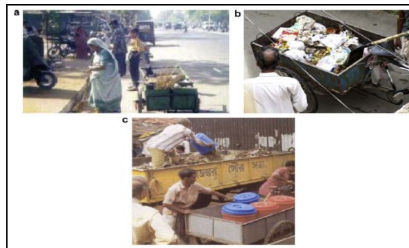
Figure 2: Road Sweeping (a), regular handcarts (b) and containerized handcarts (c). [5]

Hazra and goel 2009 gives an overview of current solid waste management (SWM) practices in Kolkata, India and suggests solutions to some of the major problems. More than around 2920ton/day of solid waste are generated in Kolkata Municipal Corporation, 60–70% are collected with the deficient in terms of manpower and vehicle availability. And conclude Lack of suitable facilities (equipment and infrastructure) and underestimates of waste generation rates, inadequate management and technical skills, improper bin collection, and route planning are responsible for poor collection and transportation of municipal solid wastes.