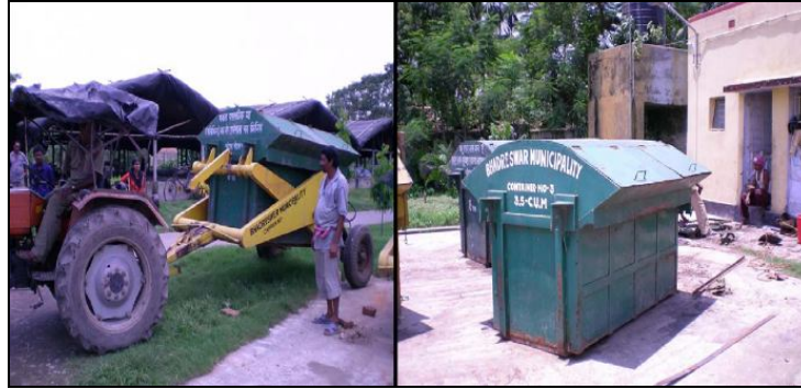
Figure 3: Example of a hauled container system used in Bhadreswar municipality, West Bengal. [6]

condition, inadequate labor for collection and transport of waste, and lack of waste treatment and disposal facilities. 12 samples are collect and tested and various parameters such as moisture content, total solids, fixed solids, organic carbon, volatile solids and calorific value are analyzed and revealed that Kharagpur has high moisture content and low calorific value, making aerobic composting the best treatment strategy. Composting can help to divert more than 80% of the total waste and will lead to enormous savings in costs of waste collection, transport and disposal. The remaining waste can be disposed off in an engineered landfill. Augmentation in labor and vehicle inventory has been proposed along with better treatment and disposal facilities.