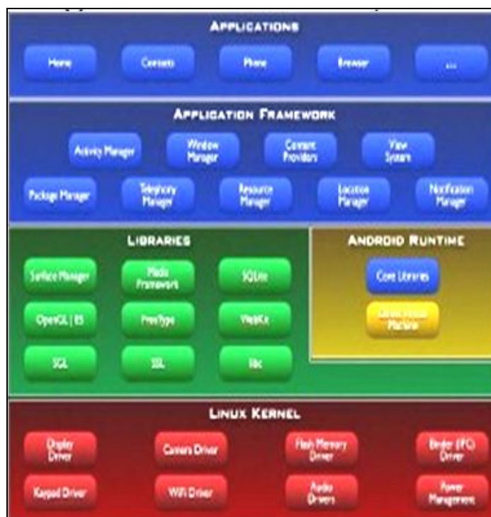
Figure 1: Android Architecture