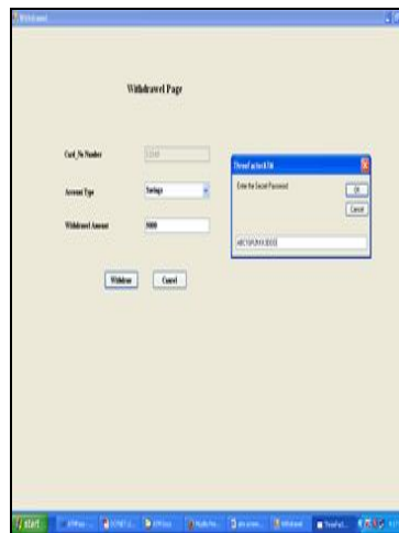
Figure 5: Salting Process