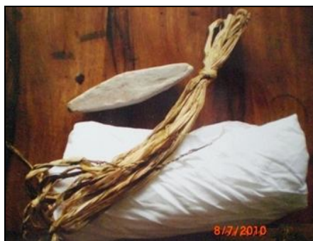
'Xe, ala kple aklala'

The sight of this is a sign of protection from the rain or the sun. It provides visual knowledge, and can be done by any one. One can quickly look for one's source of protection from the mercy of the weather, where umbrella is not readily available. Man must learn to understand the wisdom of God in providing man's basic needs of life. "Learn to explore and use the resources of your environment" is the message.