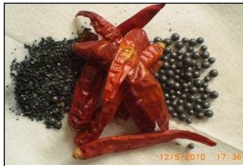
'Du, atadi kple tukpe'

According to the respondents, the sign is a warning to people not to interfere with anything that has to do with the deity's ram. In other words, one does not interfere with a property that does not belong to one. One will invite trouble if one does otherwise. Therefore, the sight of the three white cowries on the neck of the ram is meant to prevent vices or negative attitudes to life.