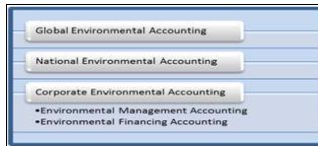
Figure 2: Types of Environmental Accounting