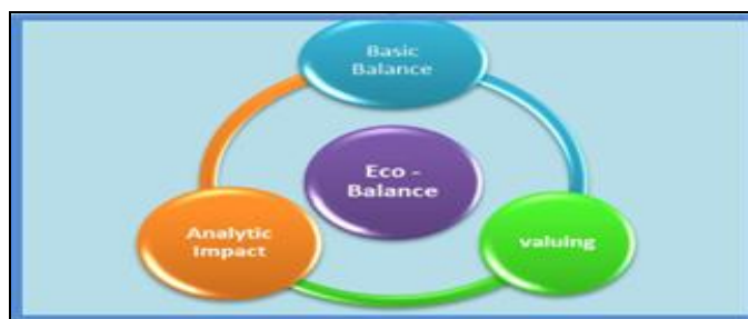
Figure 5: Cycle of Eco-balance