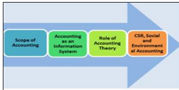
Figure 1: Flow of environmental accounting

The scope of environmental accounting is to look for the transformations in the ways in which accountants assess and report corporate performance. The development of the sustainability agenda is embraced by environmental accounting to account for the cost involved for sustainable development of the environment, society and the economy. This means that business people and accountants must recognize the delivery of economic prosperity, environmental quality and social equity simultaneously