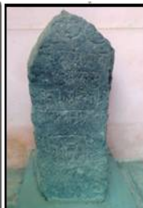
26. Pune (Bharat Itihas Samshodhak Mandal)