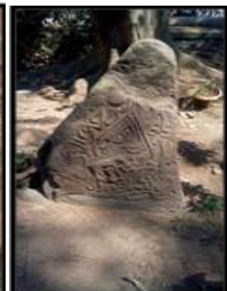
33. Satara Museum