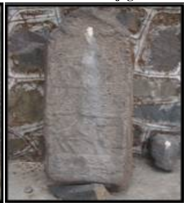
7. Chakreshvar Wadi-a