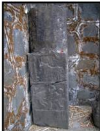
8. Chakreshvar Wadi-b