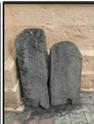
30-a, 31-b. Sagarashvar