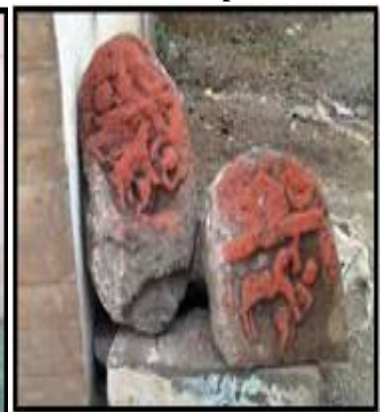
27-a, 28-b. Raite