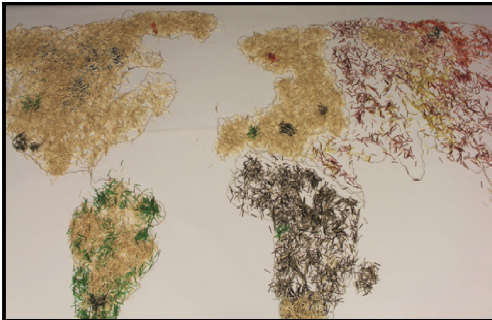
Figure 6: Clement Akpang - Clusters 2016 19x7ft – Matchsticks