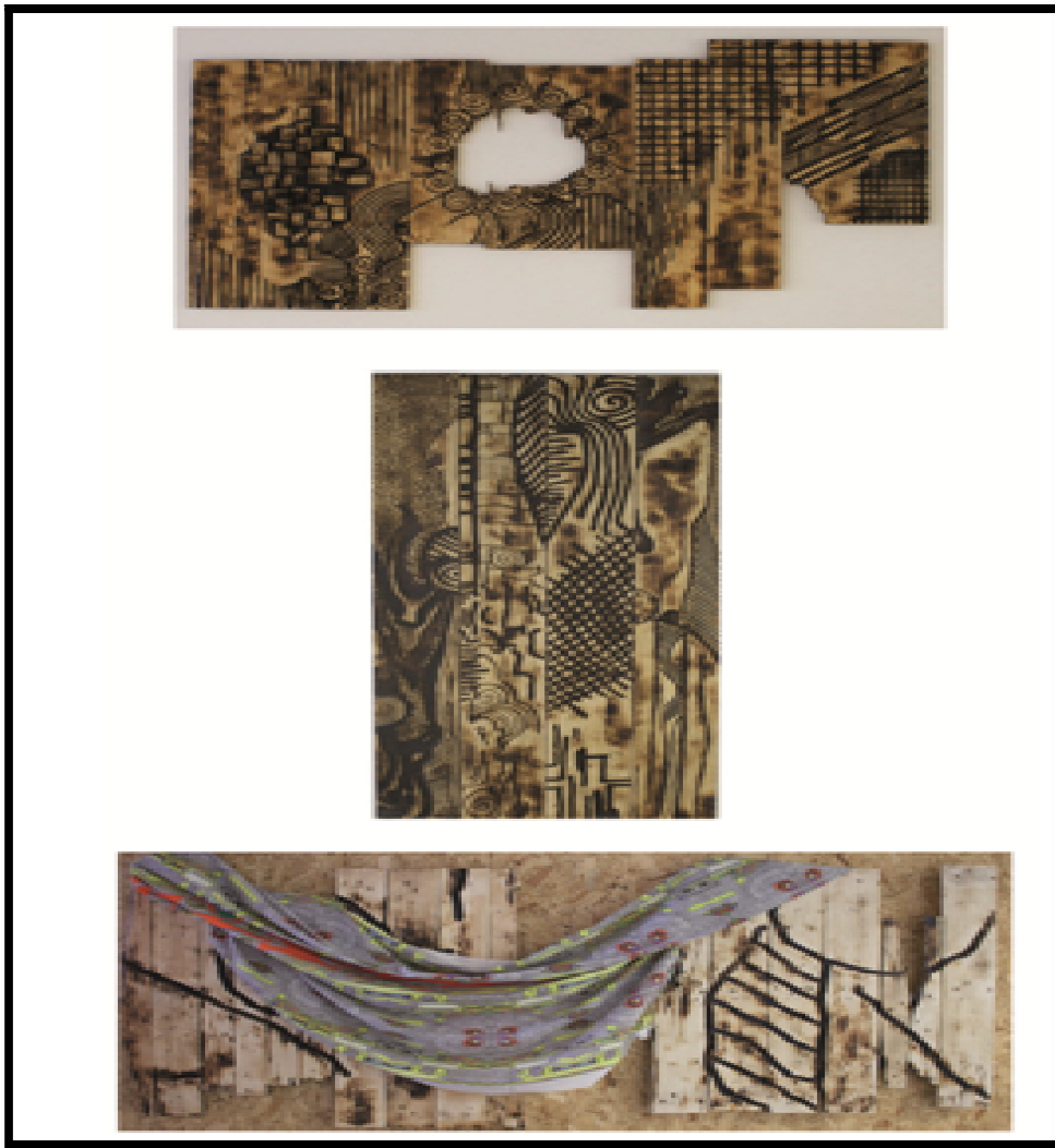
Figure 5: Clement Akpang - Reinterpretation I li lli 2015 – 2016 – Discarded