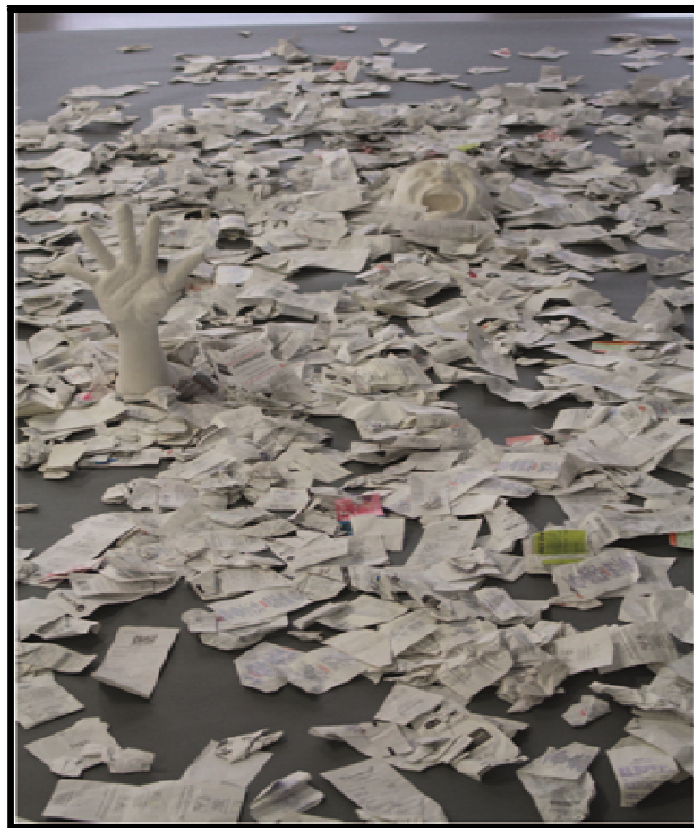
Figure 2: Clement Akpang - Price of Modernity 2016 19x7ft Discarded Receipts and Casting Plaster