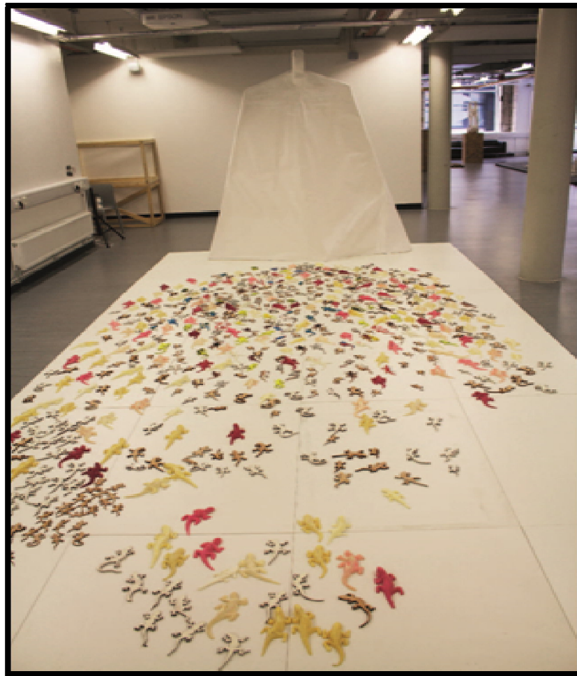
Figure 3: Clement Akpang - Excessive Individualism 2016 19x15ft Discarded Wood, Plastic, Resin and Canvass