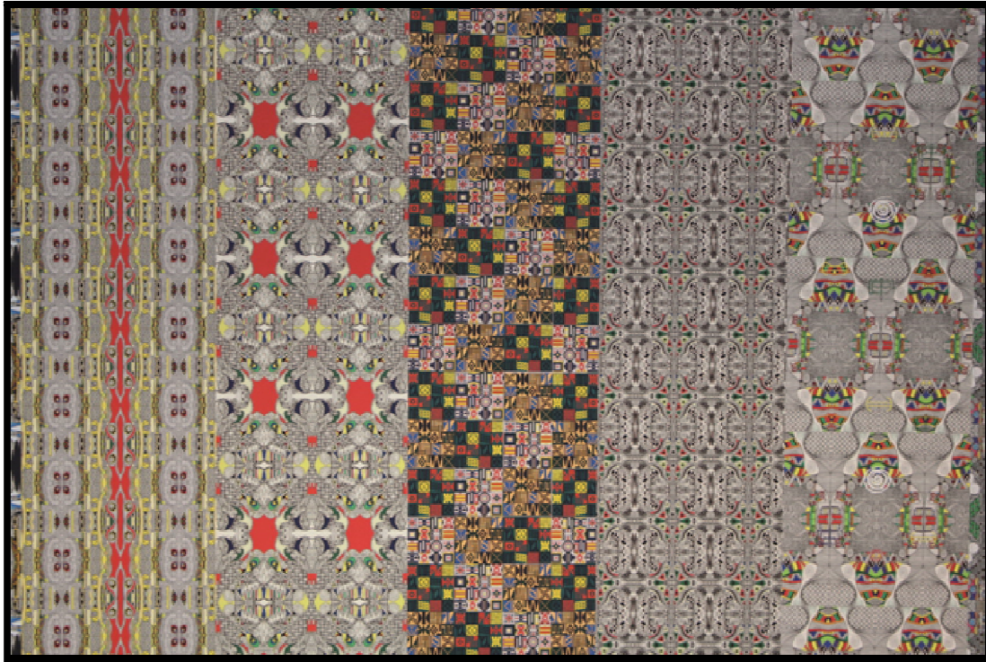
Figure 7: Clement Akpang - New Realism 2016' 14x9ft – Ink on Paper