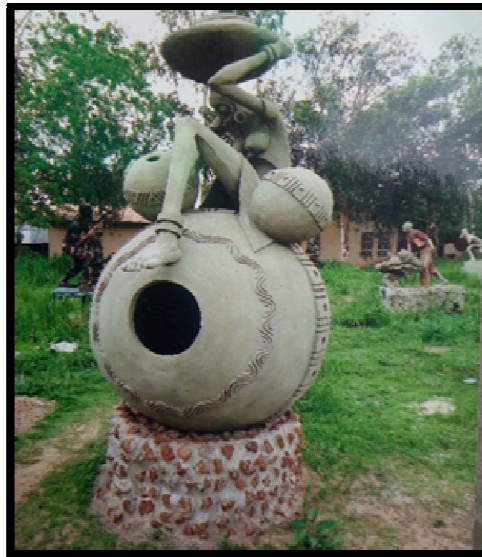
Figure 3: Okpe Byzantine (Cultural Affiliation) 2010 Direct Modelling 13ft. © Osita Williams 2019

ndigbo, not just a frivolous experience but also a serious ritual in which the collective history of the people (ndigbo) is celebrated. Visual arts are used as a medium of preservation, presentation, projection, and promotion of one's culture as exemplified in figures 1-5.