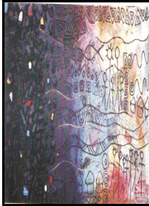
Figure 1: Uche Joel Cima, Manuscript , Mixed Media © Osita Williams 2019

The study shares the view that this forceful interception and interruption of Africa's own process of historical development by the colonial administrators impacts negatively on the people's cultural policy, process and identity, for which ndigbo are grossly affected till date. For this reason, Emeji (2001:107) opines that in the declaration of the principle of international cultural cooperation adopted by the united nations General Assembly of 1966, it was resolved that each culture has a dignity and a value which must be respected and preserved, and that every people has the right and duty to develop It's culture in their rich variety and diversity". However, visual arts play complimentary role to culture in every organized society. It facilitates the effective existence of culture and culture on the other hand provides a suitable playground for massive existence of visual arts. The study shares the view that visual arts promotes culture and both work together to achieve a common goal ---- harmonious, educated and effective existence of the society.