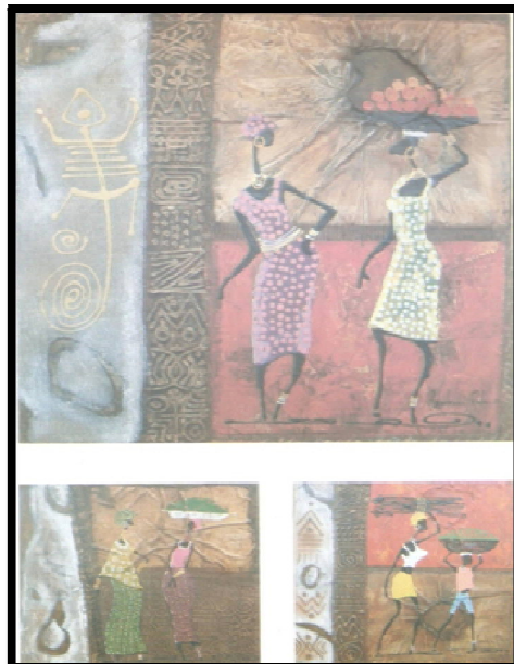
Figure 2: Ogakwu, Chinedu, as Old as Man, Variables ©Osita Williams (2019)