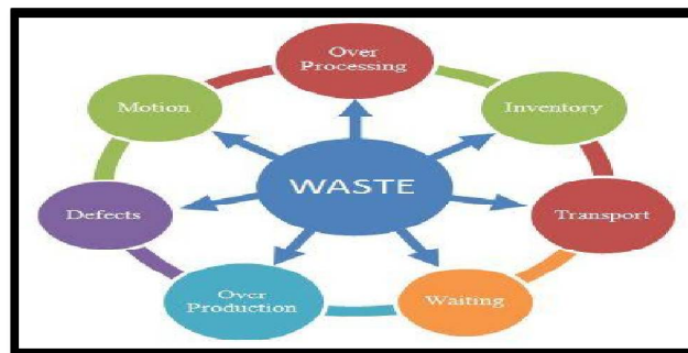
Figure 1: Non-Value Activities

Ineffective materials management practices have adverse impact on project cost, contractor’s profit margin, project duration, and can be a possible source of dispute among parties involved in the project. Therefore, inefficiencies associated with conventional practices of materials management in SME often the root cause of project performance [2]. Therefore, conventional materials management practices have failed, which affects most SME construction firms project’s performance in Nigeria directly or indirectly. [16] asserts that, reluctance to adopt new innovation of managing resources in this era of technologies pose a challenge in the face of SME’s projects performance resulting to waste generations. The consequences of materials waste are enormous because materials account for about 55% to 65% of the project cost. This indicates need for new way of managing materials in order to avoid its generation and improve SME’s performance. Fig. 1 presents the non-value activities resulting to waste generation.