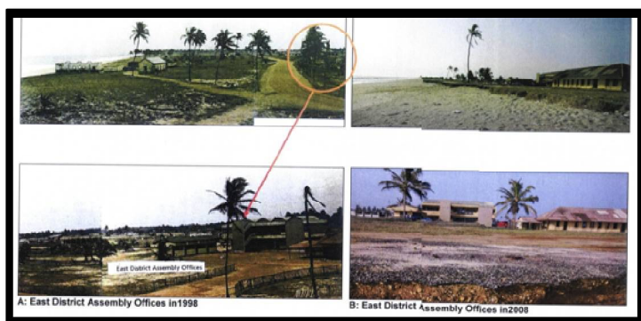
Plate 4.1: Coastal Erosion at the District Assembly Area

Based on extensive comparison of photographs and conversation with the local residents, it was observed that the coastline has moved inland over some 50 meters during the period of 1998 and 2008. Figure 4.1 shows some photographs of the Dangme East District Assembly Office which were taken in 1998 and on November 5, 2008. The retreat of the coastline is visible from the photograph below.