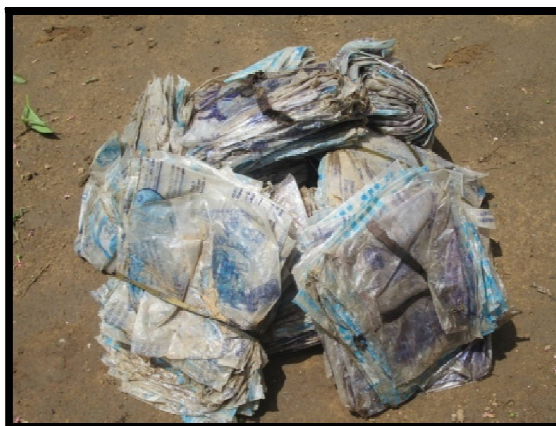
Figure 3: Derived Polypots Samples From Solid Wastes Used In Commercial Nurseries