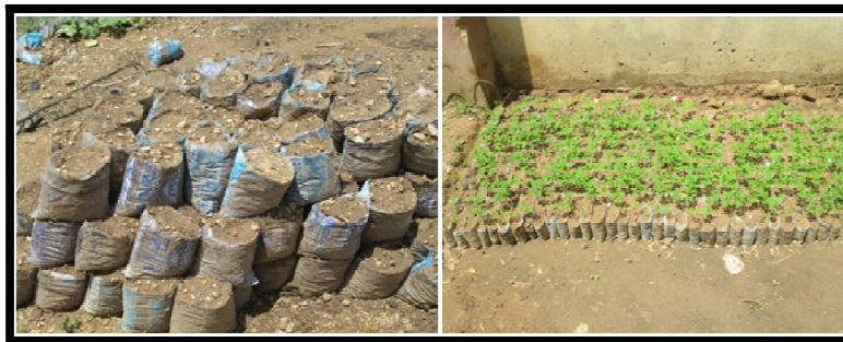
Figure 2: Derived Nursery Polypots under Utilization

The research is generally aimed at testing the strength profile of the discarded table water sachets, a solid waste used as nursery polypots by most commercial nurseries in northern Nigeria, at the same time evolving a waste management strategy against the indiscriminate presence of these sachets in our environment. The specific objectives however include the following: -