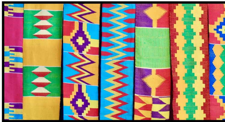
Figure 3: Ghanaian Kente Pattern Design

of Ghanaian designers, who are doing the same. This is clear in various design fields, including fashion, graphic design, product design, interior design, and a few more. Kente cloth patterns are used on clothing, bags, or other textiles, and Adinkra symbols can be incorporated into jewellery, home decor, or other products. One example is fashion design, in which Ghanaian designers are using contemporary Ghanaian fabrics and prints, such as wax prints and batik, to create modern and fashionable clothing (Adjei, 2017). They are also combining modern Ghanaian aesthetics into their designs, such as making use of vibrant colours and prints to produce clothing that is one of a kind and captures the eye.