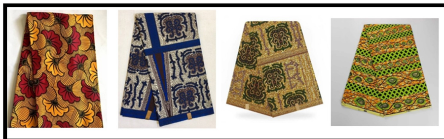
Figure 2: GTP Ghanaian Textile Designs

Additionally, there is the utilization of conventional colour schemes and pattern designs. A design may be given a more patriotic and nationalistic appeal by using the colours such as red, yellow, and green, which are also the colours used in the Ghanaian flag. Kente cloth, which is a brightly coloured and elaborately woven fabric, may be utilized as a pattern to give a design a touch of Ghanaian culture (Esaaba, 2020). Traditional Ghanaian textiles and fabrics serve as a source of creativity for contemporary Ghanaian designers, who use their work to include parts of Ghana's rich cultural heritage. Kente and GTP are two examples of Ghanaian textiles that are well-known for their vivid colours and intricate patterns. These textiles are frequently used in the design of clothing and other types of design work. Ghanaian designers are integrating local materials and techniques in their work, which is another way they are infusing aspects of Ghanaian culture into their work. In the field of product design, for instance, designers are increasingly turning to locally available materials like raffia and bamboo to produce one-of-a-kind and environmentally friendly goods.