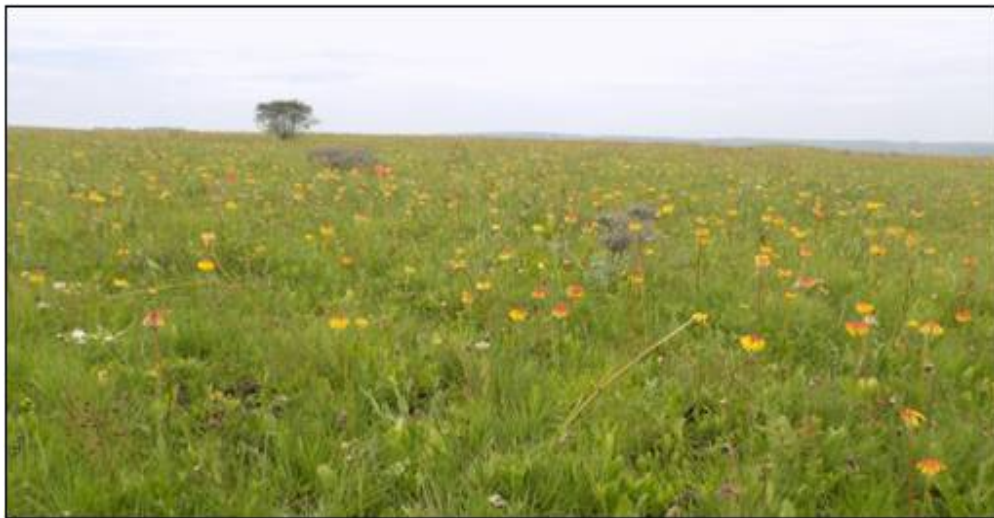
Figure 4: Wildflowers in Kitulo National Park in Tanzania