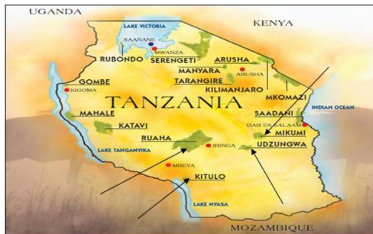
Figure 1: Map showing location of Mikumi, Udzungwa, Ruaha and Kitulo National Parks in Tanzania

Qualitative approach was used in this study for purposes of understanding promotion of national parks for domestic tourism particularly on how TV programs on national parks can be improved for domestic tourists. Tanzania has 16 national parks and this study was limited to four national parks (See Figure 1). The study area was southern national parks of Tanzania which are Mikumi, Udzungwa, Ruaha and Kitulo. These southern national parks also have tourism potential in terms of scenery, fauna and flora as per Figure 2, Figure 3, Figure 4, Figure 5 and Figure 6. As protected areas, these national parks are for current and future generations (Mkwizu, 2016b). Open ended questionnaires were used to collect data from domestic tourists through interviews. Domestic tourists were asked on their opinions for suggestions to improve TV programs on national parks. Qualitative data collection was conducted in February 2015. Convenience sampling was used and saturation level of 20 domestic tourists for interview purposes was reached hence data was subjected to content and thematic analyses.