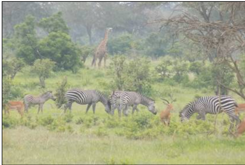
Figure 6: Antelopes, Giraffes and Zebras in Mikumi National Park in Tanzania