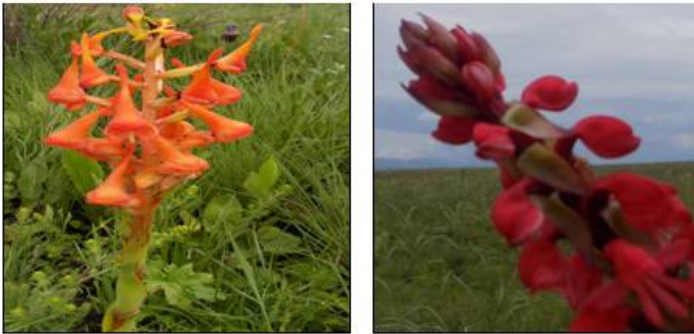
Figure 3: Orchids – the wildflowers in the ‘Garden of God’ at Kitulo National Park in Tanzania