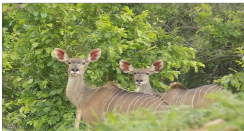
Figure 2: The Greater Kudus at Ruaha National Park in Tanzania