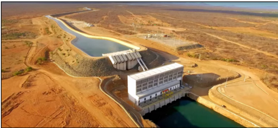
Figure 3 : San Francisco River Aqueduct.

The project forecasted the building of thirteen aqueducts, 27 reservoirs, nine pumping stations, 270 kilometers of high-voltage transmission lines, nine 230-kilowatt substations, and four tunnels, generated 10.394 direct jobs and demanded 3.221 machinery equipment (MIN, 2016), as shown in Figure 3, as follows: