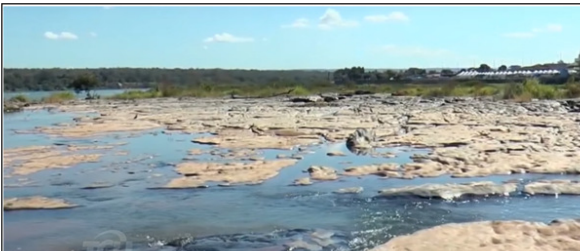
Figure 8 : The lack of integrated planning and corruption led the São Francisco River to its exhaustion.