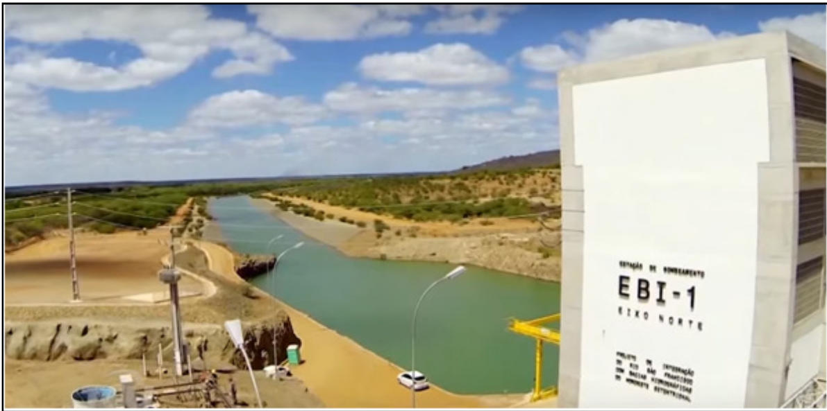
Figure 6: Pumping station EBT-1.

The lack of due planning has driven the São Francisco river to get dry, according to Figures 7 and 8, as follows: