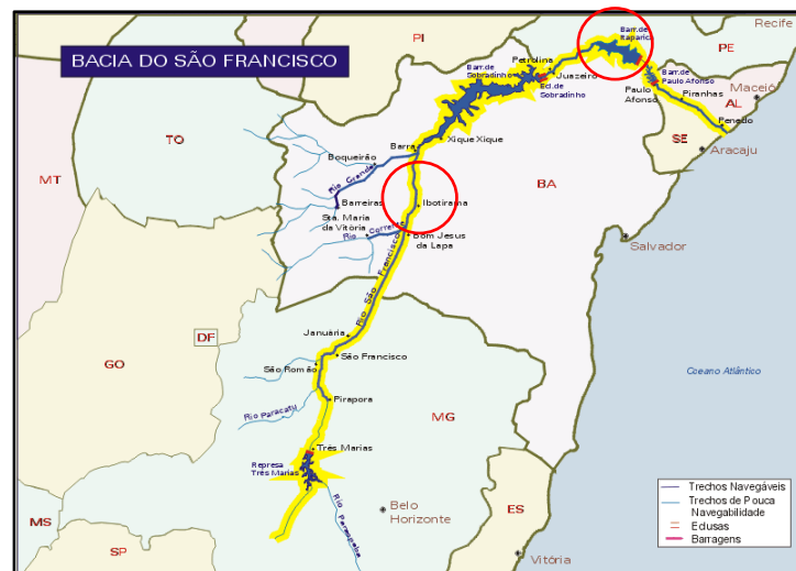
Figure 1: San Francisco River (in yellow) crossing five Brazilian states. Bahia and Pernambuco states are circled in red

The São Francisco River crosses the states of Minas Gerais, Bahia, Sergipe, Alagoas, and Pernambuco, over 521 municipalities. It was born at the Serra da Canastra, at Minas Gerais state (Southeastern region), passing through the Northeastern states of Bahia, Pernambuco, of Alagoas and Sergipe, draining a geographic area of 641,000 km 2 (IBGE, 2016) and flowing into the Atlantic Ocean, as shown in Figure 1, as follows: