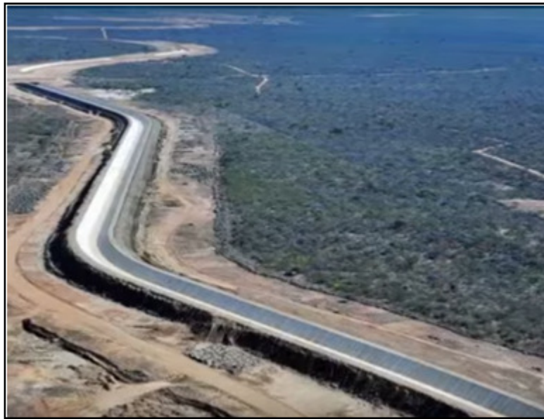
Figure 4 : São Francisco River civil work.

For instance, the San Francisco River was 2.943 m 3 /s river flow, almost 70 times less than the Amazon, which is 209.000 m 3 /s, i.e. seventy times smaller than the Amazon river flow, in comparison. It is equal to 1,58% of the National average flow, which is 179.516 m 3 /s (ANA, 2016). According to the Brazilian San Francisco Basin Committee (CBHSF), the San Francisco river flow in December 2016 was approximately 900 m 3 /s. It has been reduced by two-thirds its original river flow (CBHSF, 2016).