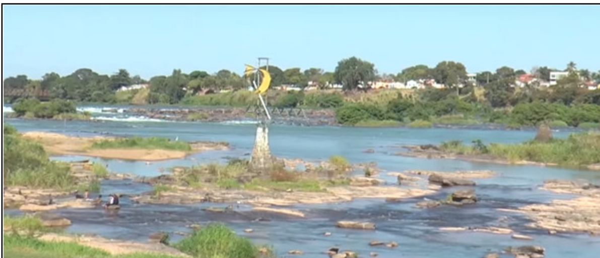
Figure 7 : The São Francisco River getting dry.

The lack of due planning has driven the São Francisco river to get dry, according to Figures 7 and 8, as follows: