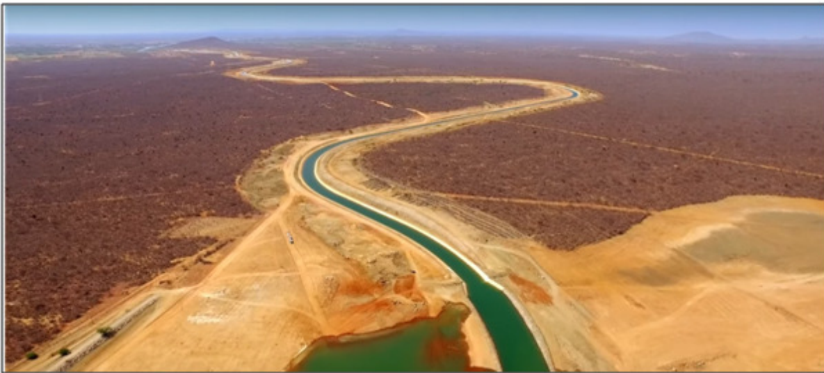
Figure 2 : San Francisco Rio Transposition.

The project was first idealized by the emperor D. Pedro II in 1847 and revisited during the first Getulio Vargas Government (1930-1945).