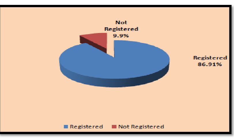
Figure 3: Business Registration