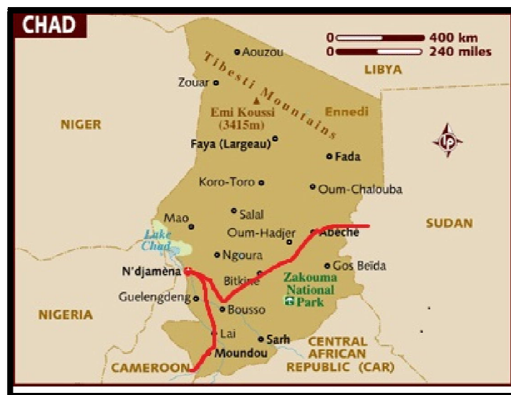
Figure 4: Suggested Railway in Chad

Despite the fact that a number of investments in road infrastructure are made by foreign investors, the governments of these three countries should encourage public and private partnerships for the financing, construction, and exploitation of transport infrastructures, to complement the investment of public funds. It will be also necessary to maintain adequate and timely road networks that need to be rehabilitated to reduce financing in the long term.