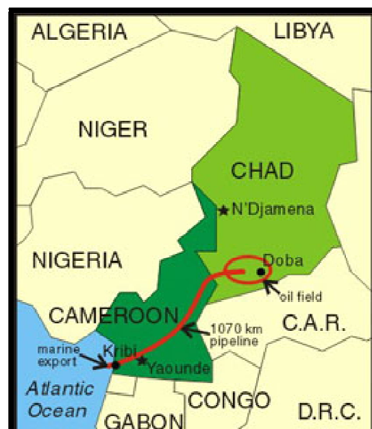
Figure 3: Chad-Cameroon Pipeline Map

The first extraction of crude oil petroleum began in 2004, once the oil is extracted; it is conveyed by a 640-mile underground, a capacity of 225,000 barrel is extracted per day.