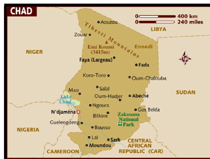
Figure 2: Map of Chad

Chad is a landlocked country located in Central-North Africa. Surrounded by Niger, Cameroon, Nigeria in the west, Libya in the north, Sudan in East and the Central African Republic in south.