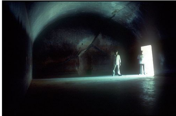
Figure 3: Barabar Caves (A Passage to India by David Lean)

The expedition to the Marabar proves catastrophic to all the characters except Professor Godbole; all unities break apart, and negative unities take their place. As a consequence of Adela's charge of attempted rape against Aziz, the Indians, in spite of having numerous differences among themselves, unite in hating the British; whereas, the British become one monolithic order in imposing their hegemony over the Indians. The crisis that arises in the caves spreads into many directions: Aziz's invitation to intimacy turns upon his own head; he spends an enormous amount of money in order to procure himself affection and kindness of his guests but what he gets instead is a serious charge of attempted rape by Adela. Adela loses her balance of mind in one of the caves and comes out transfigured as a hideous incarnation of her muddled intellect. Mrs Moore is greatly agitated after having gone into one of the caves; the echo unsettles her so much that the effect of it undermines her spiritual capacities. No one in the novel except Godbole escapes the muddle they create in their minds. 9