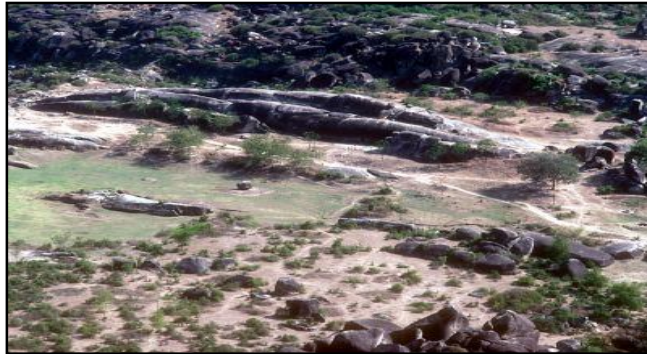
Figure 1: Barabar Caves (A Passage to India by David Lean)

the overarching sky” (APTI 6). Nevertheless, Nature embodied in the ‘extraordinary’ caves suggests dynamic forces of chaos which tend to disrupt self-complacent beliefs and ideas, whether of the Empire’s or the individual’s. The caves belong to the autonomous realm of Nature. Forster prepares readers in advance to expect something ‘extraordinary’ attached to the caves. Much of it is left unsaid about them until they are visited by Dr Aziz and his guests. Forster employs the Marabar as a metaphor of transformation. 7 Not all characters respond to it in the same way, and realize to the full the transformation it brings about.