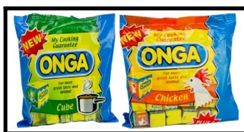
Figure 10: Onga Cubes, Chicken and Beef

In providing varieties, increasing its seasoning base, staying relevant in the market, Onga cube seasoning was introduced in 2014 in 3 spices of Onga Beef and Onga Chicken. 102