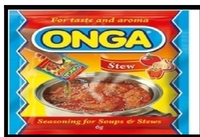
Figure 9: Onga Stew Sachet

Its target was females within the age ranges of 18-35 years who were just starting to cook or who were not yet set or hooked on cubes. 100 Its competitors are Maggi from the stables of Nestle, Gino cubes from the stables of Africa GB Foods Manufacturing Nigeria Limited, MaDish seasoning, SpiCity seasoning among other brands. However in ensuring Onga's competitive strength in the market place, Onga 3 in 1 seasoning (Ginger, Onion and Garlic) flavour in 5g, and 50g Stock Keeping Units (SKUs) was introduced into the Nigerian market in 2017. 101