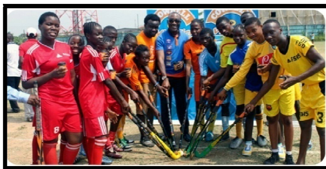
Figure 11: Head, Legal and PR, Promasidor Nigeria (Middle) Flanked by Some of the Beneficiaries of the Hockey Sticks Donated by Promasidor in Association with BME Concern and Ripples

With the goal of building and developing the nation through sports and committed to preparing young footballers to shine as stars in the future, the company founded Cowbell Football Academy in 2012. 124 The academy is an annual three (3) weeks summer camp particularly for pupils and students on long vacation (operation catch them young) between the ages of four (4) and seventeen (17) 125 , directed towards the total development of the Nigerian child through sports and extracurricular activities 126 , with a view to not only making profit but keen on creating activities and platforms that would provide a 360 degree development opportunity for Nigerian children in both academics and extracurricular activities. 127 The academy runs three (3) centres nationwide in Ikorodu,, Surulere and Benin. 128