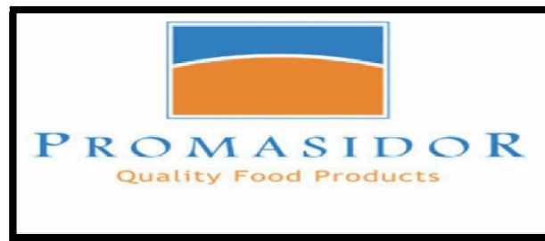
Figure 1: Promasidor Group Logo

In demonstrating the values of the company, blue, white and orange colours were used to design her logo. Blue stands for expansiveness and loyalty. Orange stands for creativity, white for purity or perfection. The origin of Promasidor Zaire forms the basis for the establishment of other branches with Nigerian outlet in 1993.