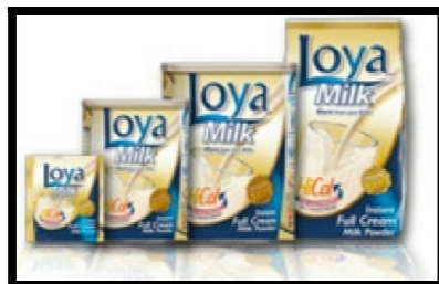
Figure 7: Loya Milk Image

Loya Premium Full Cream Powdered Milk was launched into the Nigerian market in May 2004. 89 For the optimum competition of Loya in the market place, in 2010, it was repositioned , repackaged and reformulated with 50% more Calcium – HiCal. 90 Loya milk from research has been termed the best dairy product from the stables of Promasidor Nigeria for its creamy and rich taste that in spite of its higher price of #1000 in comparison to Cowbell and Milksi which sells for #780. Loya receives a higher level of patronage. 91 In December 2012, in promoting public awareness, reaching its targeted audience, good health and good sales, Michael Collins Ajereh better known as Don Jazzy ; a popular Nigerian record producer, singer , song writer and Chief Executive Officer of Mo'Hits now Mavin Records was unveiled as its new brand ambassador to project the brand's "class and taste". Loya has also been sustained on the strength of its radio and television adverts. Promasidor Nigeria's dairy brands competitors are Peak milk from Friesland Campina stables, Dano milk from Arla, Olympic from PZ Cussons, Hollandia from Chi among other brands.