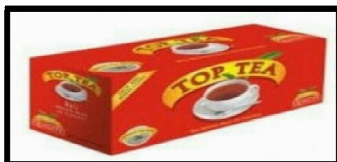
Figure 8: Top Tea Image

In Promasidor Nigeria tea category is its sole Top Tea brand. It was introduced into the Nigerian market in April 1998 as Nigeria's first tea in round bags in four (4) pack sizes of different capacities of 26 bags, 100 bags and 500bags respectively. 92 In March 2004, its packs were consolidated and there was the introduction of sachet tea. 93 In November 2009, Top Tea package was changed and a new communication director was hired to help promote Top Tea in the market place. 94 Its market target was men and women within the age range of 30-45 years, professionals and contemporaries. 95 Its key competitors were Lipton, Prime Tea, Highland Tea and City tea. In renovating and repositioning Top Tea for favourable competition and provision of varieties, various varieties have been introduced such as black, ginger lemon flavour and lemon and lime flavours. Available in tagged, untagged round and envelope bags. In spite of the huge competition it faces from Lipton tea from the stables of Unilever, it has had a fair share of the market through its renovation of introducing tea of various shapes such as round and envelop, tagged and untagged, promo packs, souvenirs, television and radio adverts among other channels and its price that has been consistently low A sachet of 2 bags is at the rate of #20.