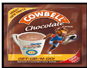
Figure 4: Cowbell Chocolate Image

In the Company's continued quest for staying relevant, competing favourably, crushing competition, care for the wellbeing of Nigerians, and a good response to market feedbacks, Cowbell plain milk was re-invented. In August 1998, Cowbell Cocoa based beverage called Cowbell Choco was introduced into the Nigerian market. 81 Prior to the Choco launch, the market was dominated by Milo from Nestle, Horlicks from James & William Horlicks, Bournvita from Cadbury, Vitalo milk from Vitalo, and Ovaltine from Associated British Foods. Promasidor Nigeria pioneered the 3 in 1 segment {Cocoa+ Sugar+ Milk} of the category. 82 In 2011, the revenue from this category was $80million. 83 Cowbell Coffee milk drink was also introduced in the year 2000. 84 Promasidor Nigeria has employed various strategies in promoting and ensuring the survival of Cowbell in the market place in spite and in the face of competition and with the aim of increasing its share in the market place, promoting and creating awareness. Cowbell marketing strategies have been innovative and aimed at reaching its targeted audience.