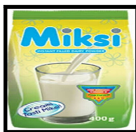
Figure 5: Miksi Image

In 1999, Miksi Filled Milk Powder was introduced. 87 In 2010, the Miksi Choco variant 3 in 1 (Cocoa+ Milk+ Sugar) Instant Flavoured Milk was introduced. 88