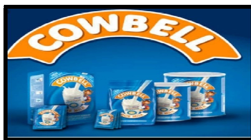
Figure 3: Cowbell Milk Image

In capturing a fair share of the Nigerian dairy market, its 1 st product available was Cowbell Milk and its other dairy brands were introduced subsequently.