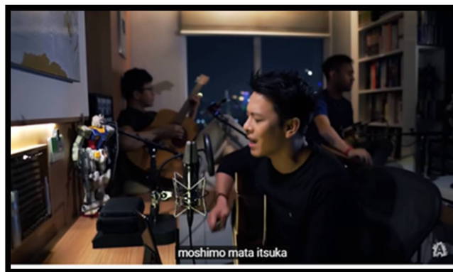
Figure 1: Indonesian Pop Song Re-Sung in Japanese by the Original Musician

ruling groups that play a role in spreading Japanese popular culture in Indonesia. The spread of Japanese popular culture not only increases opportunities for cultural exchange and cultural interaction between Japan and Indonesia but also becomes a means of hegemony in terms of culture that can influence people's mindsets and lifestyles, especially in the younger generation. In this case, the hegemonic group is a community of Japanese popular culture lovers who unconsciously consume the results of Japanese popular culture in their daily lives.